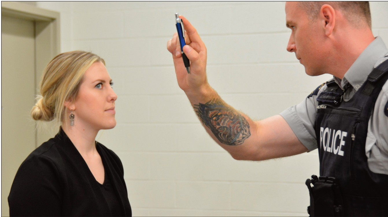
DRE officer tests a volunteer for horizontal gaze nystagmus.